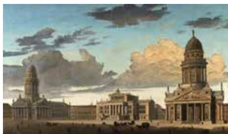
Gendarmenmarkt in Berlin, 1822

“What is the likely shape of the library of the future? And how do we build collections for it?”